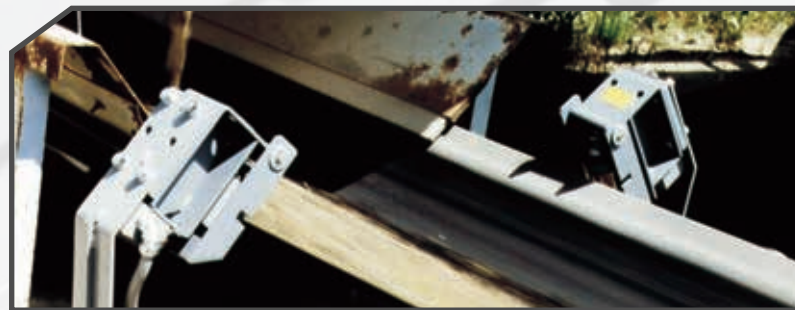
Shown are two BA units protecting a valuable conveyor belt from damage due to belt misalignment or run-off at an aggregate facility

Not less than four alignment switches shall be furnished on each conveyor. One on each side of the belt near the head and tail pulleys. For conveyors greater than 1,500 feet (457 meters) long an additional four alignment switches shall be provided evenly space, one on each side of the carrying and return belt.